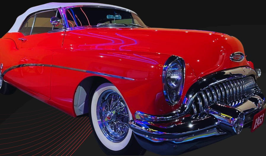
1953 Buick Skylark

Harley J. Earl, a 1986 AHF Inductee, revolutionized GM's design department, introducing clay modeling, pioneering "Dynamic Obsolescence," and creating iconic concept cars like the Buick Y-Job. He legitimized the role of design and designers. In the 1950s, Buick stunned with concept cars like the XP-300 and LeSabre, inspiring the Skylark in 1953, a hand-built factory custom and pinnacle of the Roadmaster series.