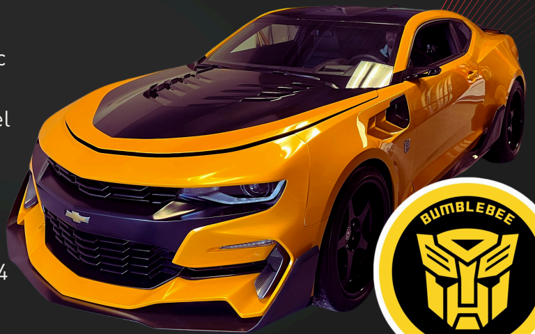
2016 Chevrolet Camaro BumbleBee

In 2005, Ed Welburn, an AHF Inductee and head of Global Design for GM, led a groundbreaking era of design, crafting iconic vehicles like the revived Camaro and pioneering concepts such as the Cadillac Ciel and Buick Avista. In the "Transformers" movie series, Chevrolet and the modern Camaro, notably portrayed as "Bumblebee," captivated audiences with stunning visuals showcasing the evolution from a classic 1974 model to the latest fifth-generation version, blending heritage with innovation.