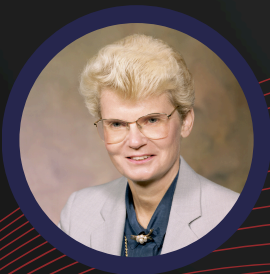
Dr. Betsy Ancker-Johnson