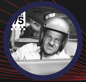
Wendell Oliver Scott